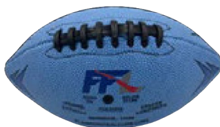
JUNIOR 9U,10U 12U GIRLS