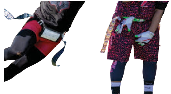
CAN NOT WEAR QB WRISTER ON BELT AS WELL AS GLOVES AND TOWELS