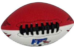
PEE-WEE 6U,7U,8U 8U GIRLS, 10U GIRLS