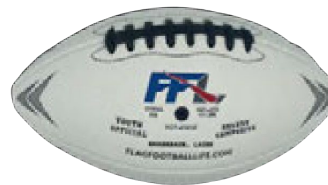
YOUTH 11U,12U,13U,14U 14U GIRLS,HIGH SCHOOL GIRLS