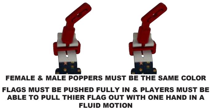
FEMALE & MALE POPPERS MUST BE THE SAME COLOR FLAGS MUST BE PUSHED FULLY IN & PLAYERS MUST BE ABLE TO PULL THEIR FLAG OUT WITH ONE HAND IN A FLUID MOTION