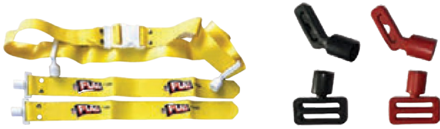
REGULAR POPPERS ONLY