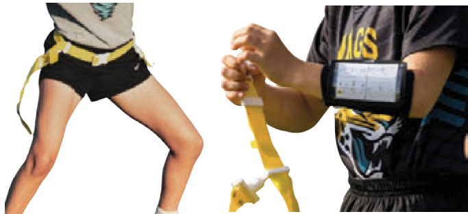
BELT IS TIGHTLY FASTENED TO WAIST WITH FLAGS ON THE HIPS QB WRISTER IS WORN ON THE PLAYERS ARM